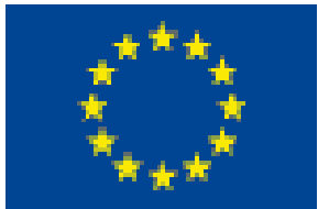
European Commission (EC)