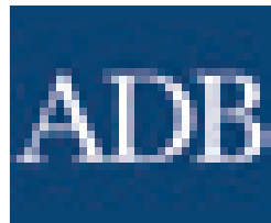
Asian Development Bank