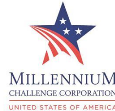
Millennium Challenge Corporation (MCC), US