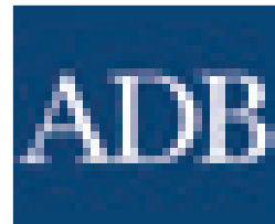
Asian Development Bank